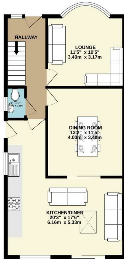
GROUND FLOOR 625 sq.ft. (58.1 sq.m.) approx.